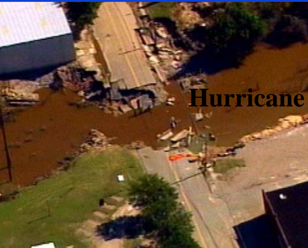
Hurricane Floyd 1999- Cat 3